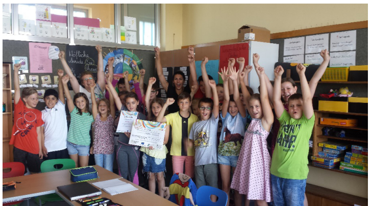
The energy team of the primary school Weiz is celebrating its success. They saved more than €1,100 euros !

€1,560 energy cost savings in the first year